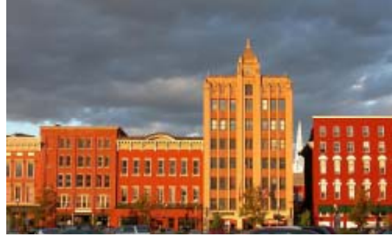
Rutland-free rent for a year Initiative