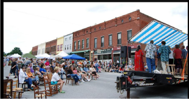
Pocock Rocks Music Festival & Street Fair, Bristol